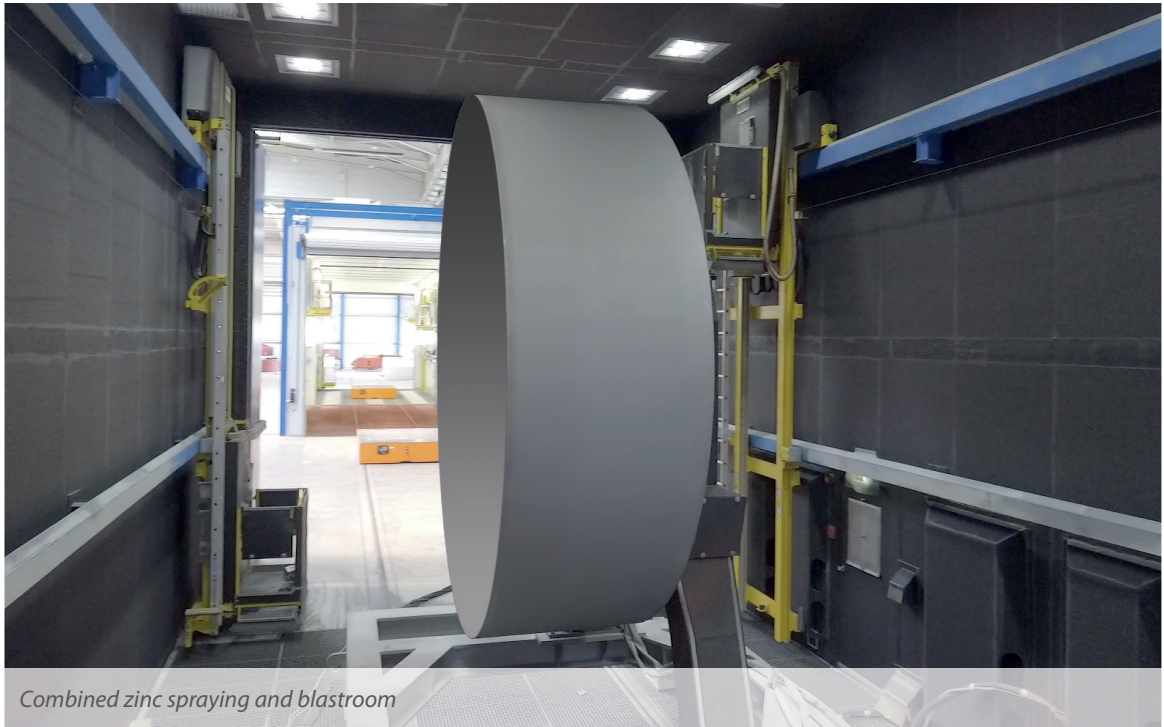
Combined zinc spraying and blastroom