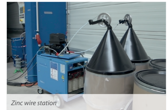
Zinc wire station