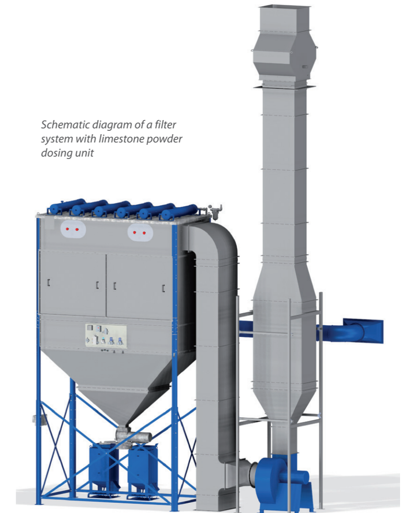
Schematic diagram of a filter system with limestone powder dosing unit

The single components can be retrofitted in existing booths, for example your blastroom, so that investing in a complete system including booth housing is not necessarily required.