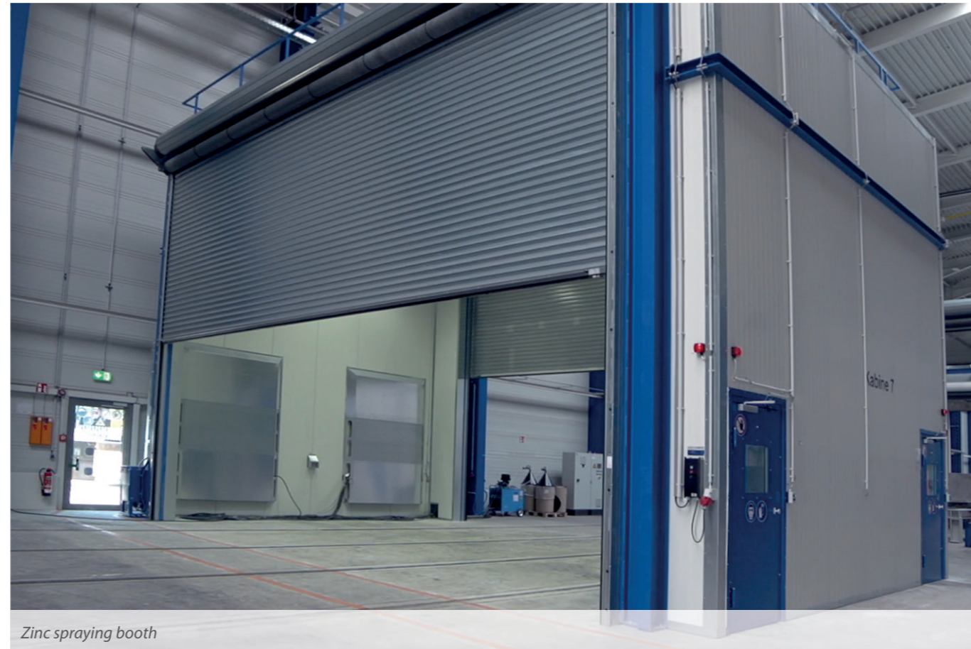
Zinc spraying booth

the respective workpieces, are equipped with a filter system specially developed for this process, including limestone powder dosing unit.