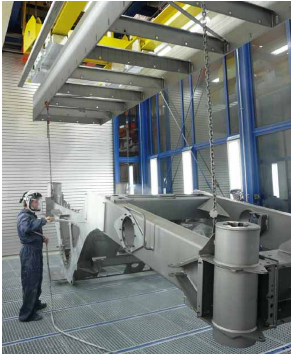
Powder coating of large components (Wirtgen GmbH)

The Wirtgen Group is an internationally active group of companies in the construction equipment industry including the well-established brands Wirtgen, Vögele, Hamm and Kleemann and has found us to be a competent system partner in the surface treatment technology.