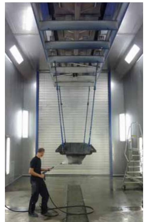
Cleaning cabin (Kleemann GmbH)

This means that the surface treatment centre consists of a high-pressure cleaning system, a combined paint spraying and drying cabin for wet paints, a paint dryer and a powder enamelling furnace. The handling of the bulky components with a weight of up to 30 tons is effected by an integral conveyor system. This allows a maximal flexibi-