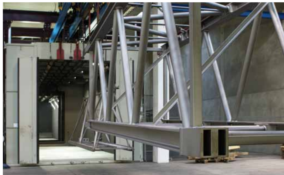
AGTOS continuous overhead rail shot blast plant (3.5 x 2.5 x 32 m)

The integrated 16 high-performance turbines with each 18.5 kW drive power are equipped with easy replaceable throwing blades. In addition to the flexibility of the machine the customer benefits from the