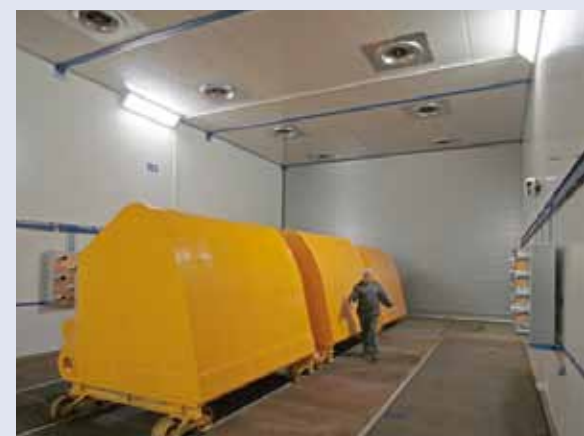
Large-capacity refrigerating dryer

Thanks to several realized reference systems we could convince the customer of the so-called "refrigerating drying" system, i. e. the drying with dehydrated cir-