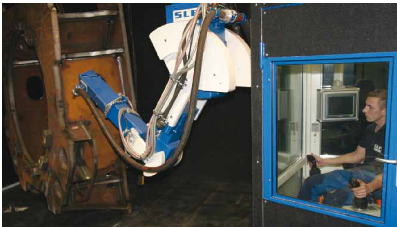
Newly developed SLF media blast robot "ReCo-Blaster"

Phone: +49(0)3722 6071-0 Fax: +49(0)3722 6071-20 post@slf.eu · www.slf.eu