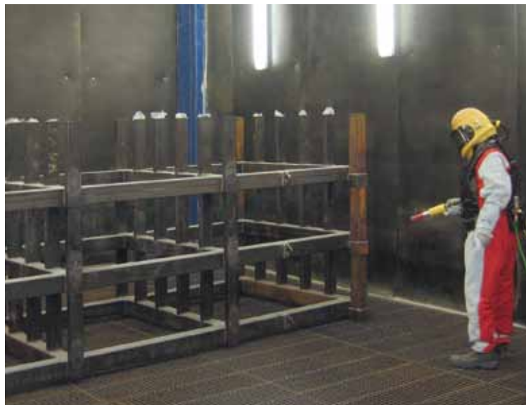
Blastroom with fullfloor recovery system

Following the aqueous pre-treatment serving the removal of grease and oil residues, the components are re-treated in a blastroom. The size of the blastroom housing is 10 x 6 x 5 m (L x W x H). The full-floor abrasive transport is performed by means of a longitudinal and cross lamella type conveyor. The energy-saving ventilation of the blastroom