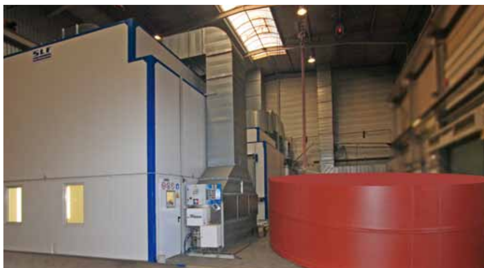
Paint spraying cabin with rotor

The energy-saving and low-maintenance design of the system technique has been a decisive factor for choosing our concept.