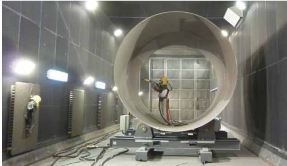
Blastroom for towers of wind power plants

Following the blasting process the tower segments are supplied to the paint spraying systems where they are primed inside and outside, top coated and then dried by heated recirculation air.