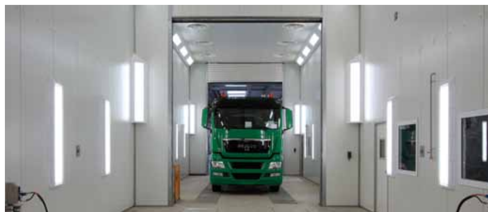
Paint spraying line at company F.X. Meiller in Munich