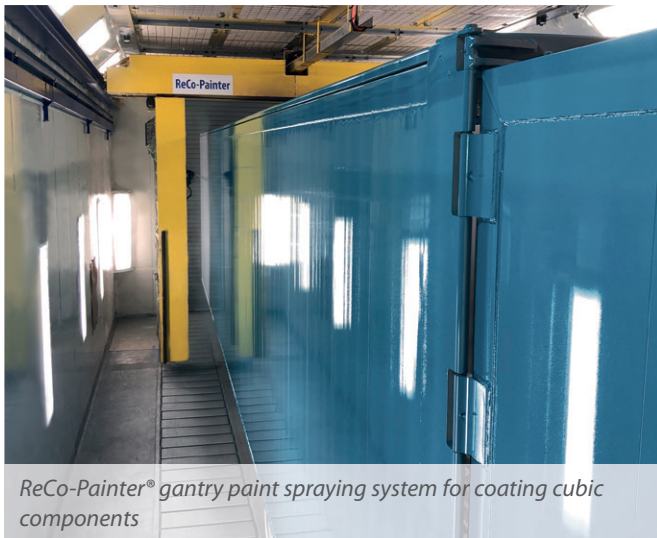
ReCo-Painter® gantry paint spraying system for coating cubic components

Quality, stability and safety are particularly important in the heavy-duty sector. It is therefore a great advantage to have just one single reliable partner for the entire system technology. SLF is your full-service supplier! Whether pre-treatment, blasting, painting or conveying – at our site in Emsdetten, all components are precisely matched to each other and thus fulfil the highest demands in your production process. Our highly skilled employees even personally carry out assembly and service at our customers' premises.