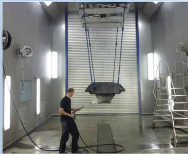
Cleaning cabin (Kleemann GmbH)