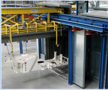
Powder coating of large components (Wirtgen GmbH)