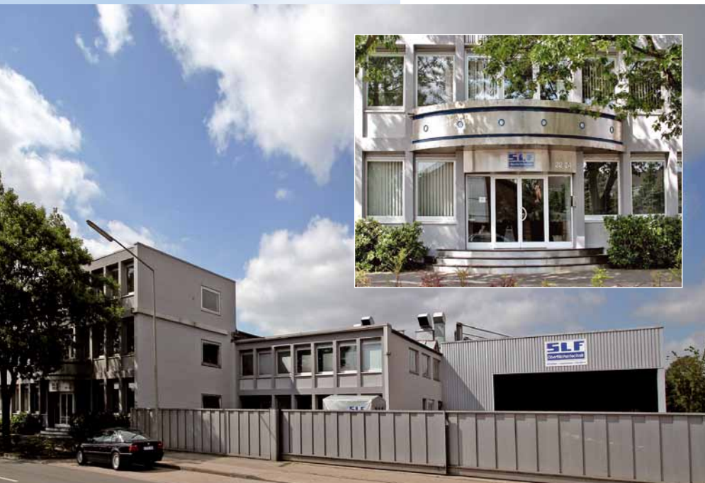
View of SLF Head Office in Greven-Reckenfeld.

The SLF team has worked together since the early 1990s. Originally founded as Schlick Chemnitz Engineering GmbH, the company has outgrown its original role as a vendor of blasting and coating services to become a supplier of solitary painting and blasting units as well as complete surface treatment lines also comprising pre-treatment systems and conveying technique.