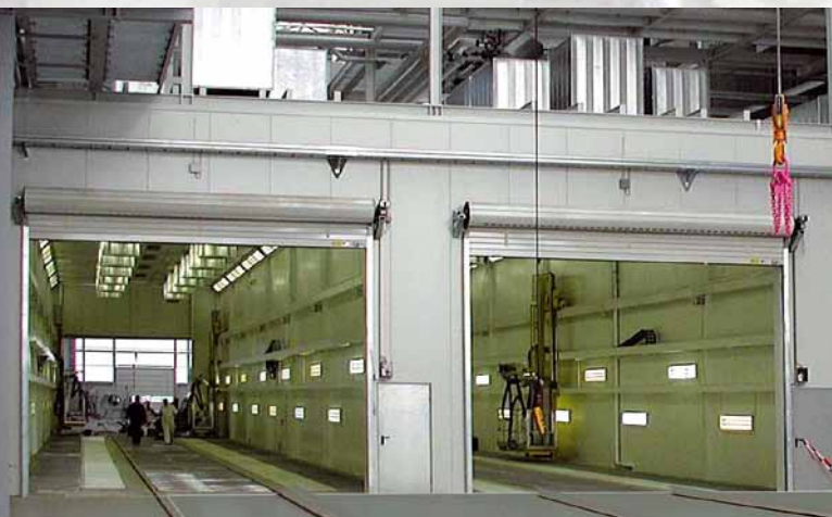
Combined painting and drying cabin with sectional ventilation by means of long-range nozzles for rotor blades.