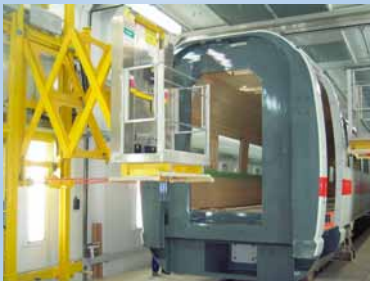
Painting hall with sidewall scissors-type lifting platform.