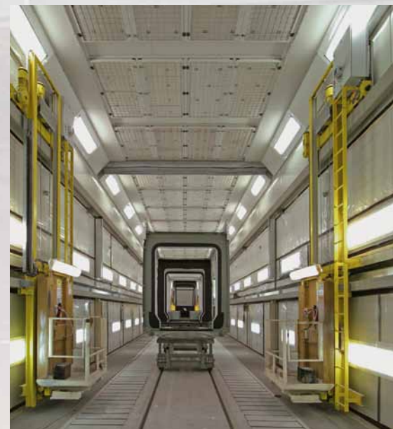
Combined painting and drying cabin with sectional ventilation system for passenger coaches.