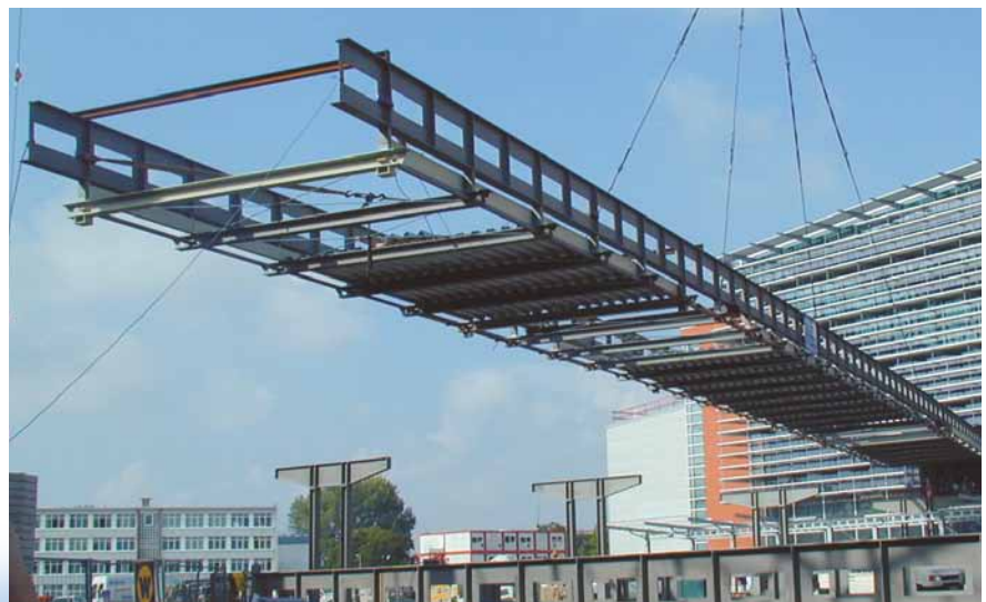
Passenger bridge for the Dresden Airport, processed at the SLF Anti-Corrosion Center in Mühlau.