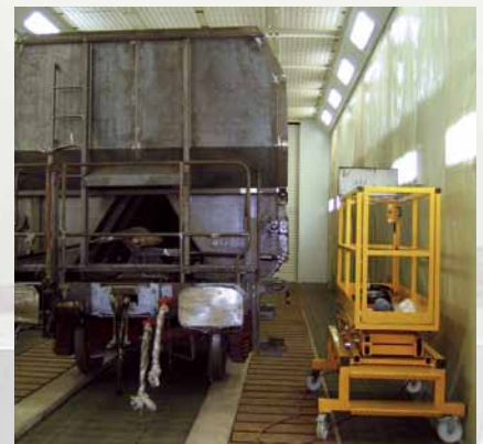
Combined painting and drying cabin for railway waggons.