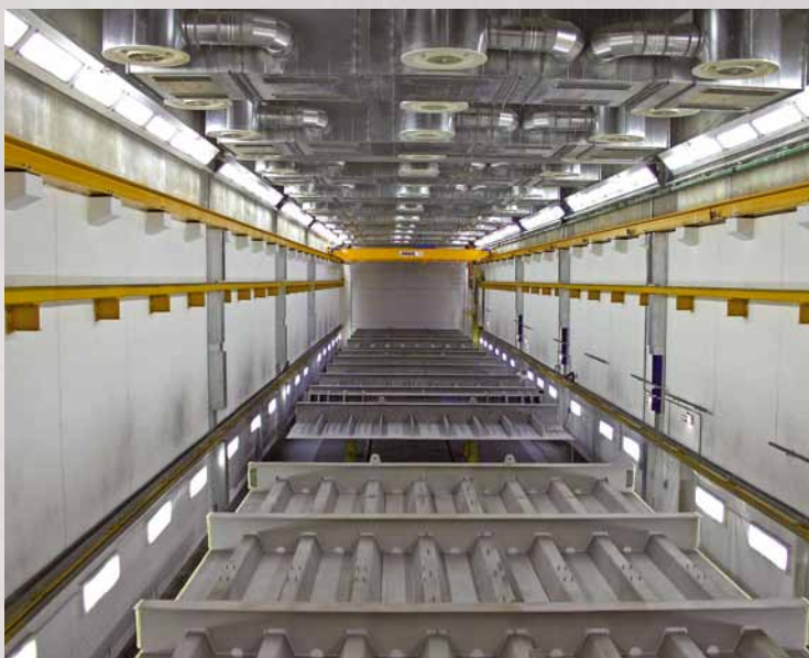
Combined painting and drying cabin with sectional ventilation by means of long-range nozzles for bridge elements.