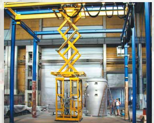
3-Axes telescopic platform for processing large components.