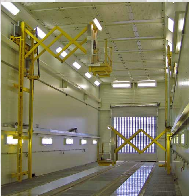
Travelling sidewall-mounted scissor-type lifting platforms in a painting cabin.