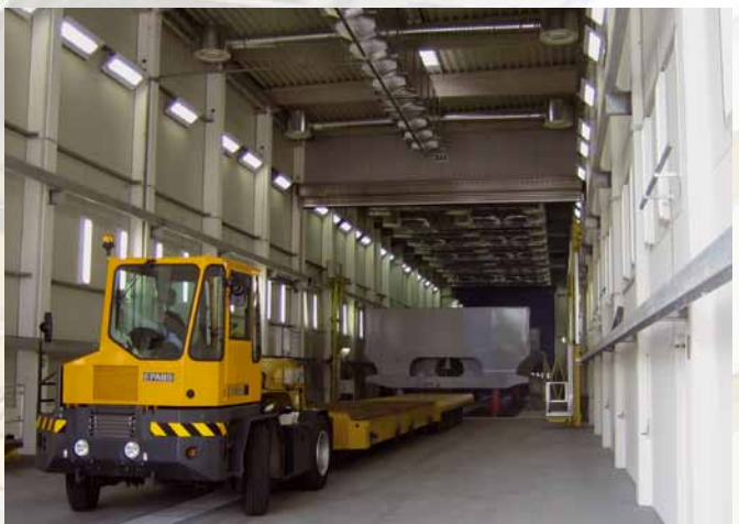
High-pressure cleaning room and combined painting and drying cabin with sectional ventilation system for large components.

For the coating of blasted products and components SLF provides the necessary painting technique, like e. g. painting cabins, paint dryers, combined painting and drying cabins, powder coating systems or simple paint booths.