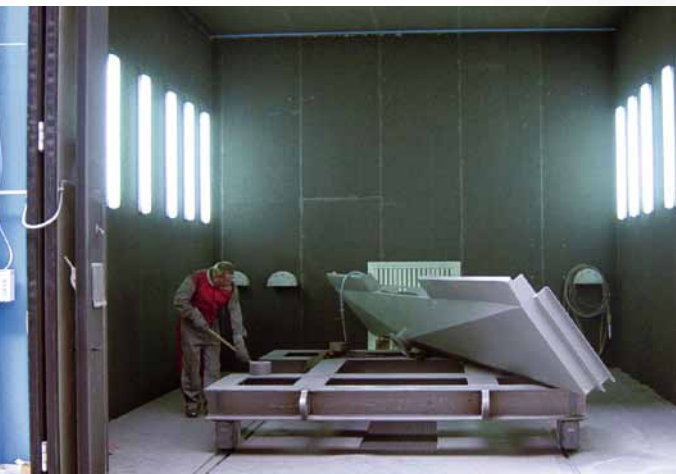
Blastroom for large components.