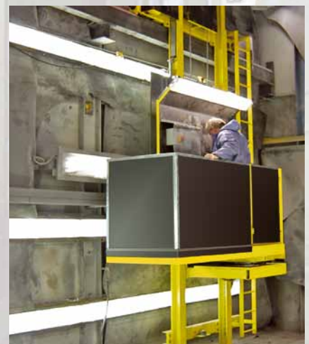
Mobile, swivelling working platform in a blastroom.