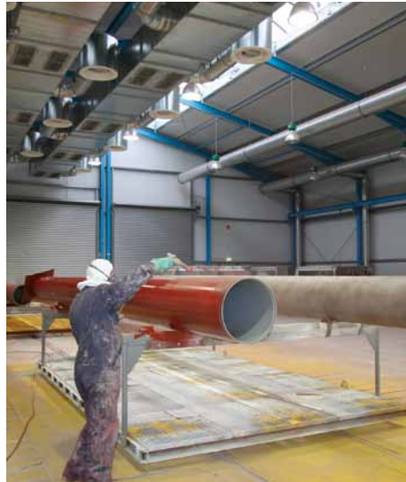
Open-space painting system for the multi-functional production.