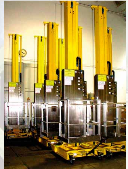
Mobile lifting platforms.