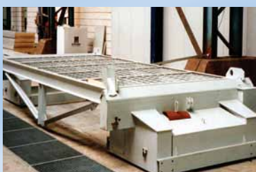
Heavy-duty rail car.