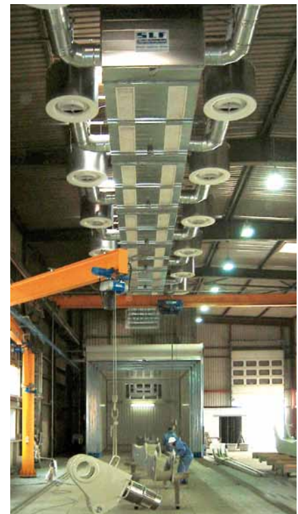
Open-space painting system with long-range nozzles and telescopic dryer.