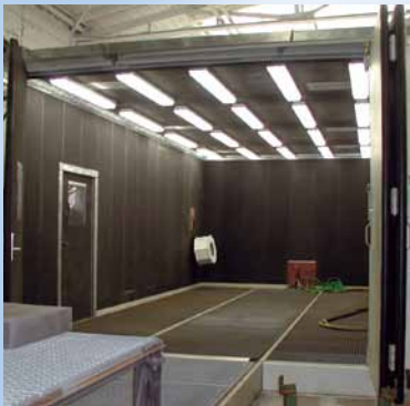
Blastroom with pneumatic media recovery without foundations.