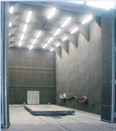
Compressed air blastrooms are offered in a variety of sizes.