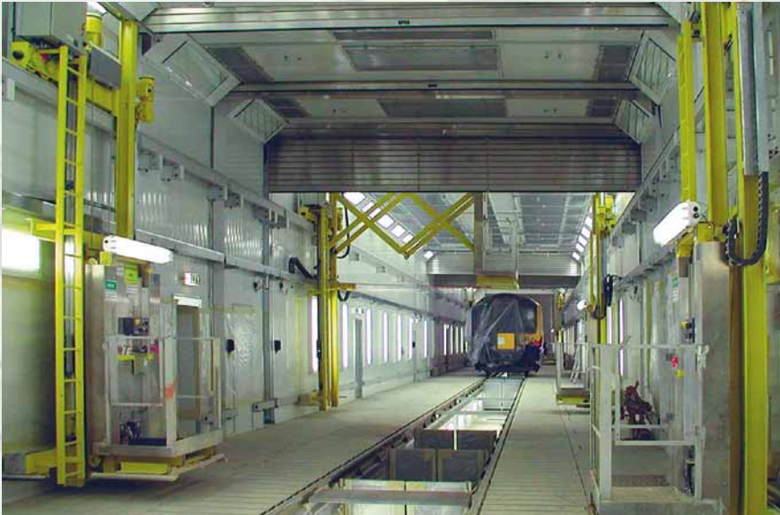
Sidewall lifting platform in a painting cabin for rail cars at Siemens AG Transportation Systems, Krefeld.