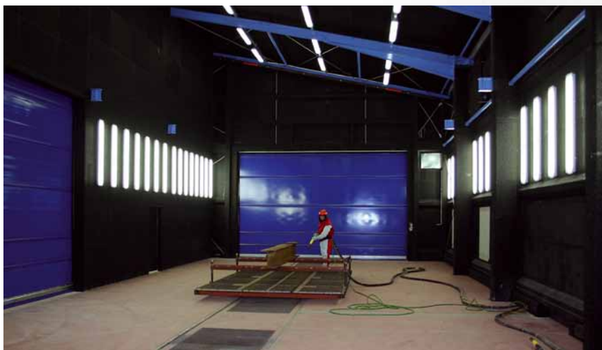
Blastroom for ship components of the Meyer Shipyards incl. partial, pneumatic media recovery.