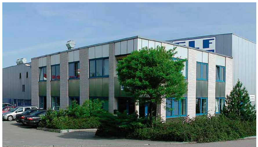
View of factory in Mühlau near Chemnitz (Plant engineering and anti-corrosion center).

So-called combined projects, consisting of compressed air and/or turbine-wheel blasting systems with or without painting systems, are now available from a "single source".