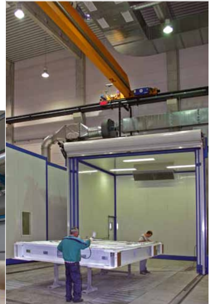
Open-space painting system with telescopic dryer.