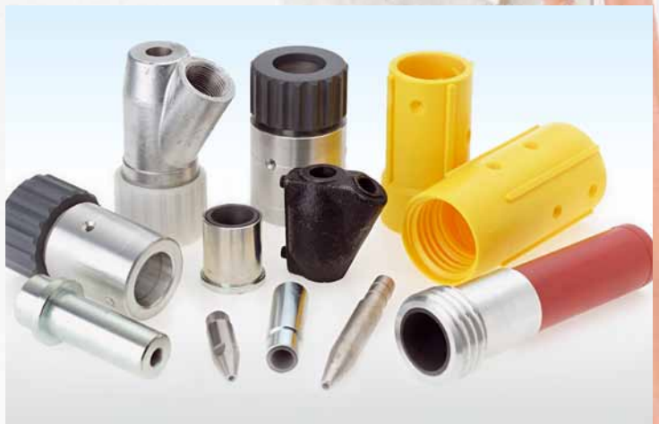
Spare and wear parts for airblast machines of different brands.