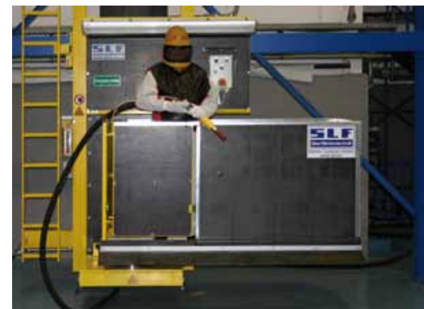
Sidewall-guided lifting platform for blastrooms

Of course, with only few adaptations our lifting platforms can also be used in paint spraying cabins, cleaning cabins, etc.