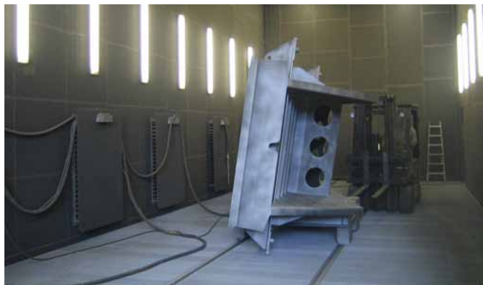
Blastroom with media recovery system covering the whole floor.

the ceiling of the hall was provided with 30 switchable long-range nozzles above the paint spraying area.