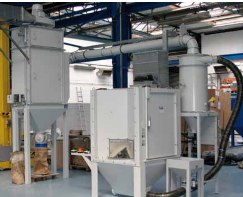
Automatic indexing table unit with direct suction system for the air blasting of synchroniser rings.

increased driving dynamics, safety, comfort and economic efficiency as well as lower fuel consumption and emissions in the automotive means of the customers: on land, water and in the air.