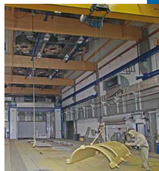
Open-space paint spraying area. In the background: Movable telescopic dryer in parked position.

Due to the large hall the energy expenditure plays an important role regarding the economical efficiency so that great importance is attached to the patented "sectional ventilation system". For this purpose