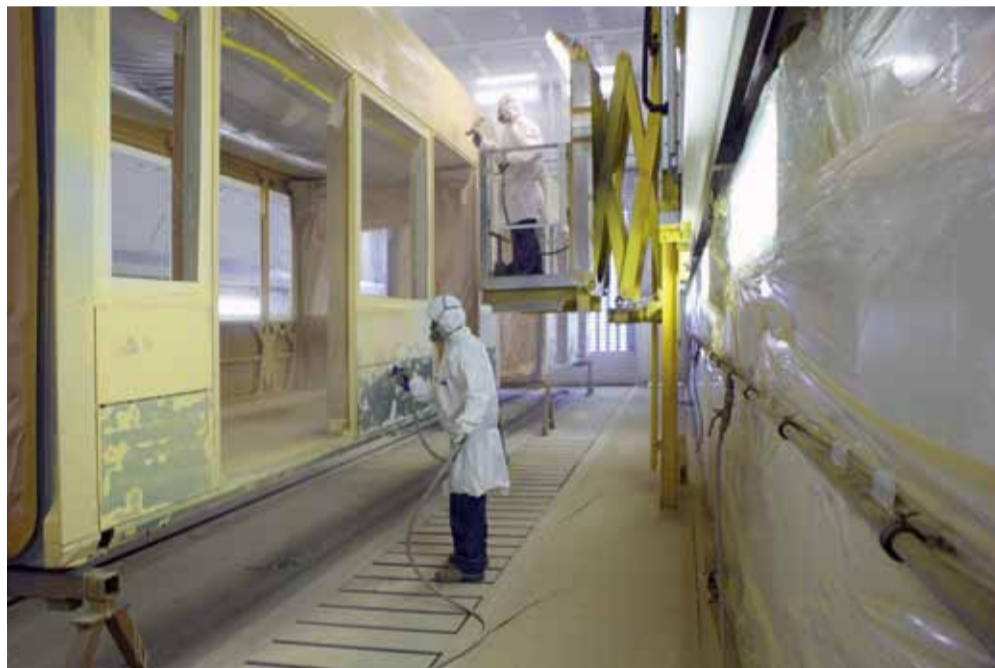
Paint spraying works on the Combino Bern in the Vienna factory in Simmering by Siemens Transportation Systems.

A comparison of the average operating costs of this system with a conventional paint spraying cabin of the same size with a use as here at Siemens in Vienna shows that considerable savings, regarding e.g. filter replacement, cleaning costs as well as heating and maintenance costs are achieved.