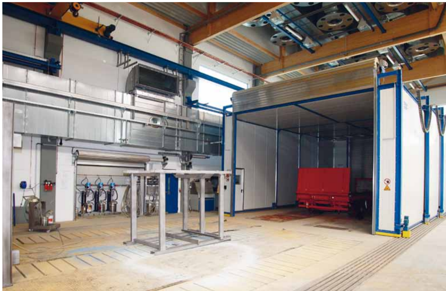
Open-space paint spraying area with movable telescopic dryer.

The internationally acting company Jöst manufactures units which recycle and convey bulk materials by means of vibration technology. From small punching sheets up to 12 m long welded constructions with a weight of up to 20 t are processed in the engineering department. Here, our task was to provide a new hall with a preparation, a paint spraying and drying equipment.