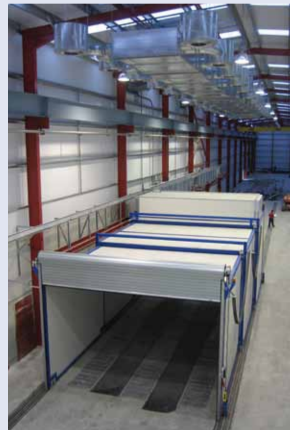
Telescopic dryer on an open-space paint spraying area.