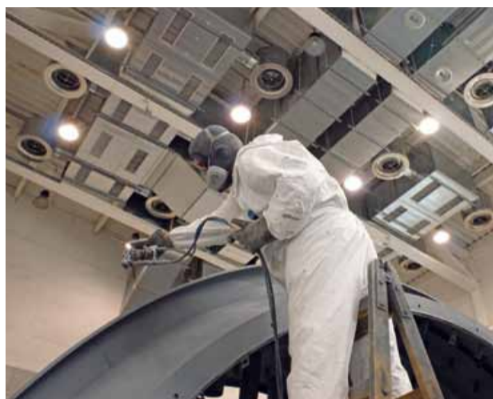
Perfect paint spraying of large components with an open-space paint spraying system.