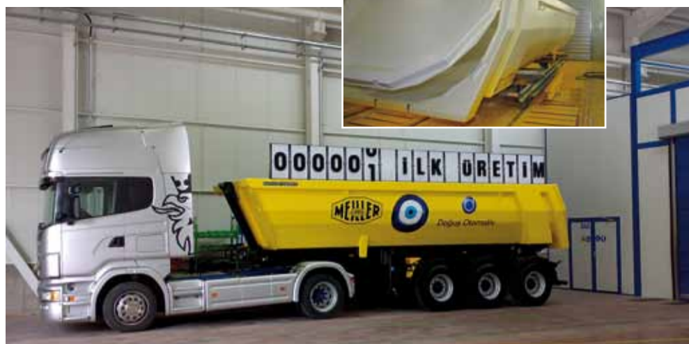
The first tipping trailer manufactured by Meiller Dogus in Turkey.